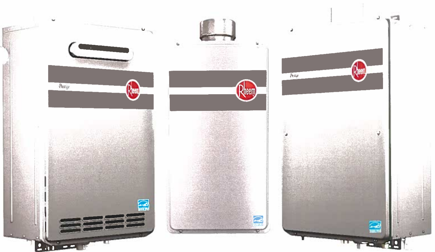
Indoor and Outdoor Tankless Gas Water Heaters